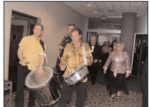
Guests followed a Batacuda dance band across the Inner Harbor to the gala at the Hyatt Regency Baltimore.